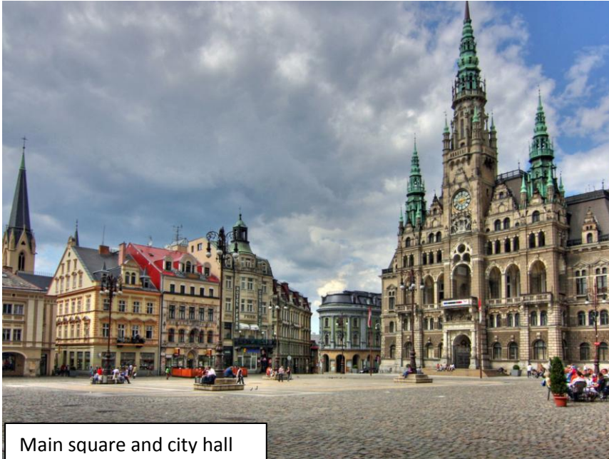
Main square and city hall

The zoo in Liberec was the first to be opened in Czechoslovakia in 1919. The zoo contains a wide